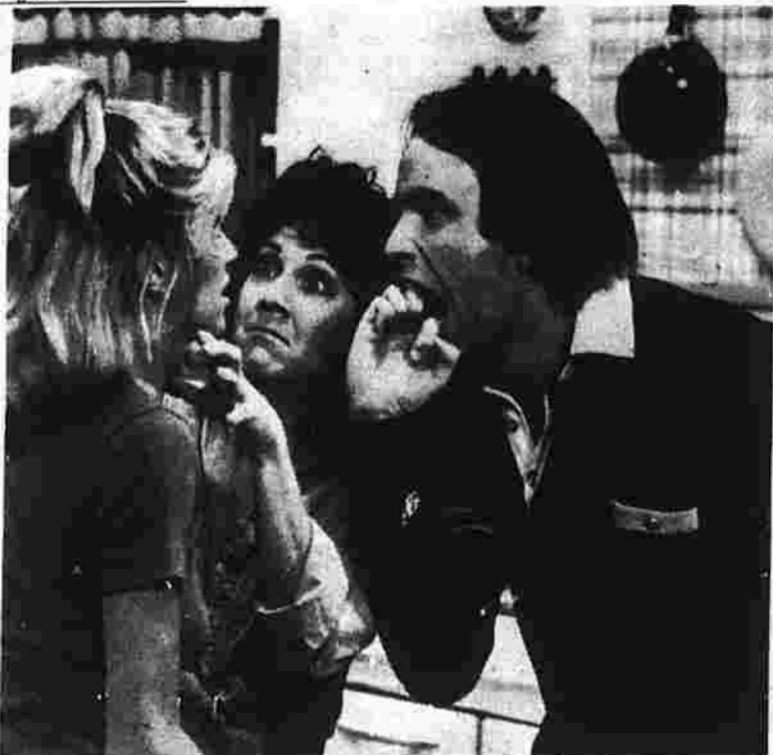
Janet (Joyce DeWitt, center) and Jack (John Ritter) greet Chrissy's (Suzanne Somers) news with mixed emotions in the "Chrissy Come Home" episode of the ABC Television Network's hit comedy series, "Three's Company," airing Tuesday, August 22.