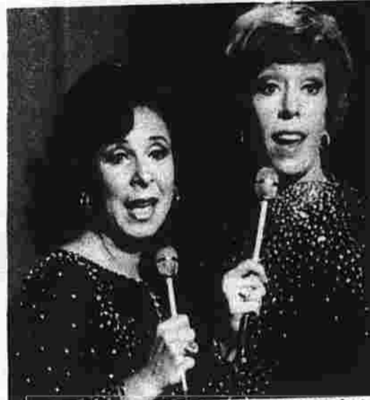
Eydie Gorme (left) and Carol Burnett sing a duet of an Irving Berlin favorite during "Steve & Eydie Celebrate Irving Berlin," the special to be presented on NBC, Tuesday, Aug. 22.