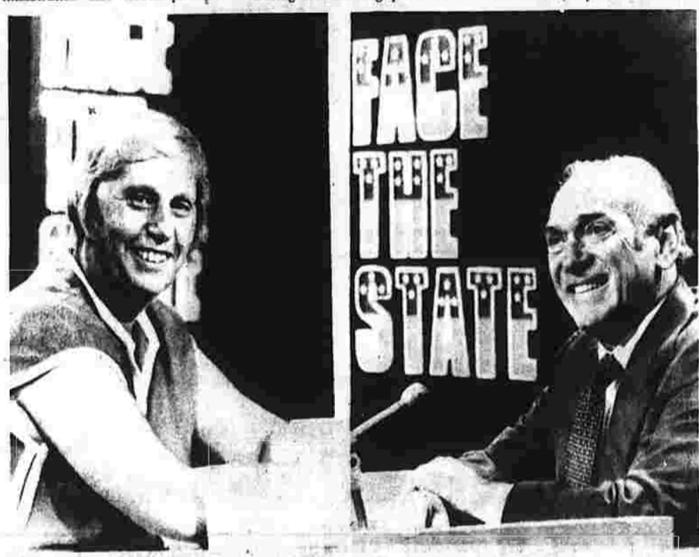
Face the State is the name of the show and is also what Gov. Ella T. Grasso and her lieutenant governor, Robert Killian, did Friday. The two rivals for the top state office of governor met face to face to tape a special show as Part 2 of their series of debates during the campaign.