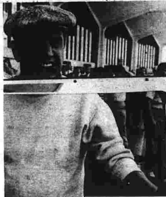
Alan King plays a cameo role as a New York City cab driver in his film for ABC-TV, "How to Pick Up Girls," which will air in the fall.