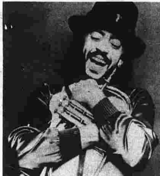
Popular jazz artist Chuck Mangione performs his recent hit "Feels So Good" and others live on the public television special "Chuck Mangione Live from Wolf Trap," Thursday, Aug. 24 on PBS.

The laser may seem like the best thing that's happened to rock music staging since the Joshua Light Show, but the Food and Drug Administration is not one of its biggest fans. The FDA is cracking down on rock groups and art shows that are using powerful laser beams to stage shows, which may be dangerous to the eyes of those watching and participating. There is fear some may even suffer blindness. To prevent such injuries a nationwide check has been initiated to learn the strength of lasers used in light shows. One band, the Blue Oyster Cult, has already been prohibited from using an overly strong beam as a special effect. The effect could be just too "special" to be safe.