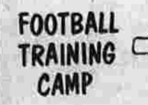
FOOTBALL TRAINING CAMP

IF THE TEAM DEMANDS, I ALWAYS HAVE MY TEACHING DEGREE TO FALL BACK ON.